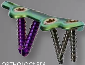
ORTHOLOC® 3Di Foot Reconstruction System MTP Fusion Plate