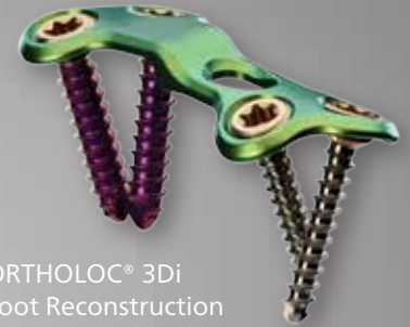
ORTHOLOC® 3Di Foot Reconstruction System Lapidus Plate