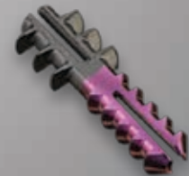
PHALINX® Hammertoe Fixation System