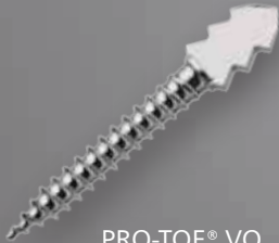
PRO-TOE® VO Hammertoe Fixation System